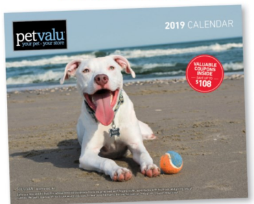
Local calendar proceeds will benefit